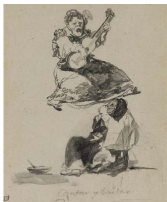
Francisco de Goya, Cantar y Bailar [Singing and Dancing], 1819-1820.

The study of Spanish drawings is a rapidly advancing area of research. Exhibitions devoted to early modern Spanish drawings are increasing in number, unknown works are being brought to light and new questions are being raised. What were the shifting attitudes towards drawing in Spain from the time of Juan de Juanes to the era of Picasso? To what extent do issues of style, subject matter and technique problematise the categorisation of drawings as 'Spanish'? How does the study of drawings enhance our understanding of Spain's artistic, social and cultural world?