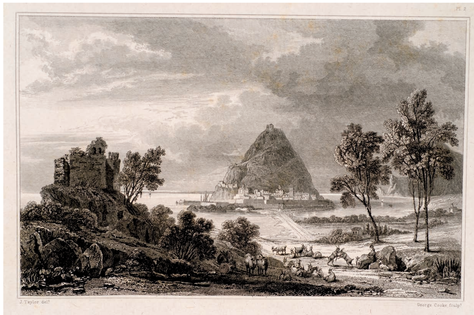
3.11. I.J.S. Taylor, St. Sébastien , in Voyage pittoresque en Espagne: Planches, Première Partie , no. 5 [Pl. 2]. Engraving by George Cooke, 124 x 199 mm. New York, The Hispanic Society of America.