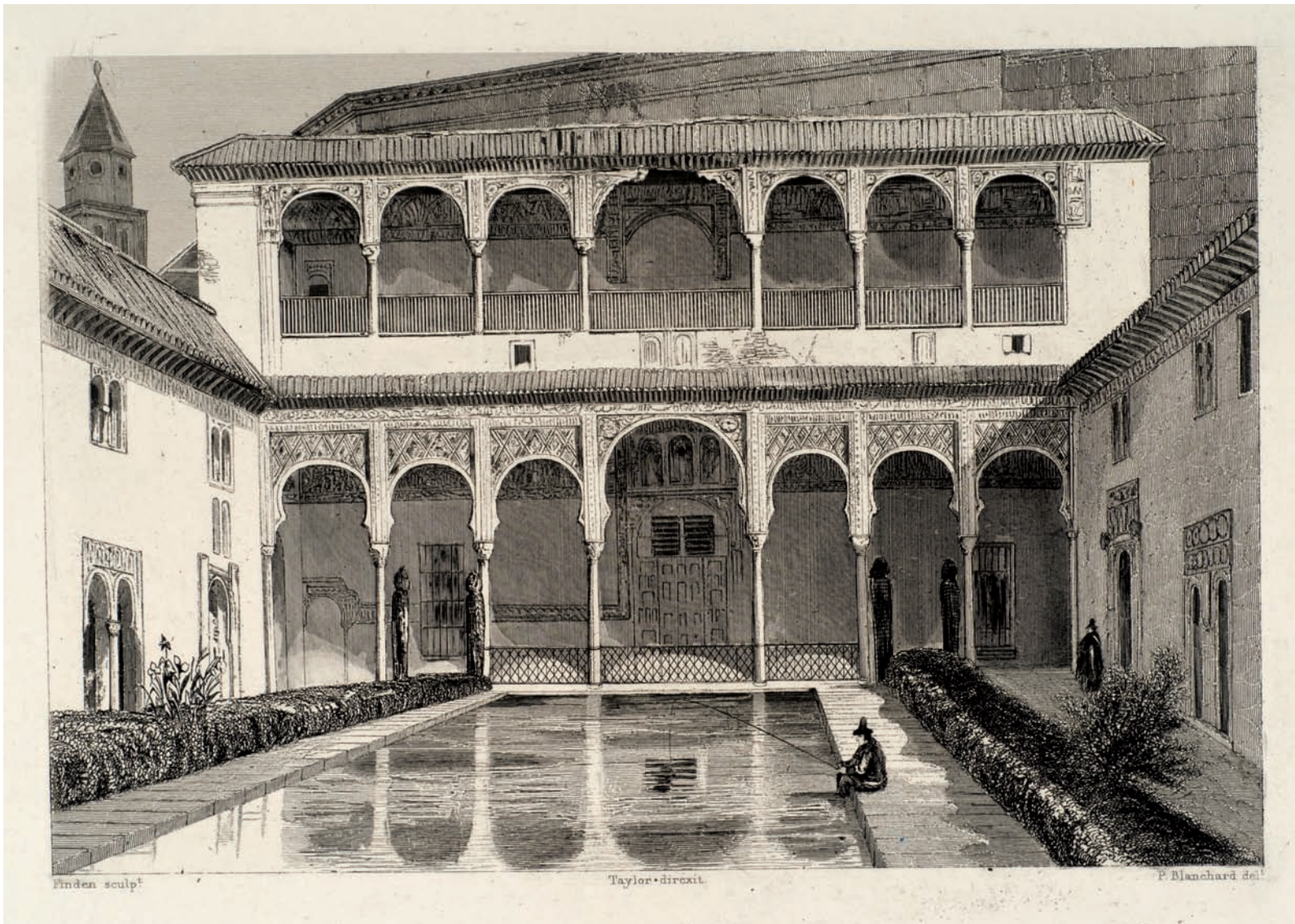
4.10. Pharamond Blanchard, Patio de los Arrayanes, Alhambra , in Voyage pittoresque en Espagne: Planches, Deuxième Partie , no. 143. Engraving by Finden, 117 x 177 mm. New York, The Hispanic Society of America.