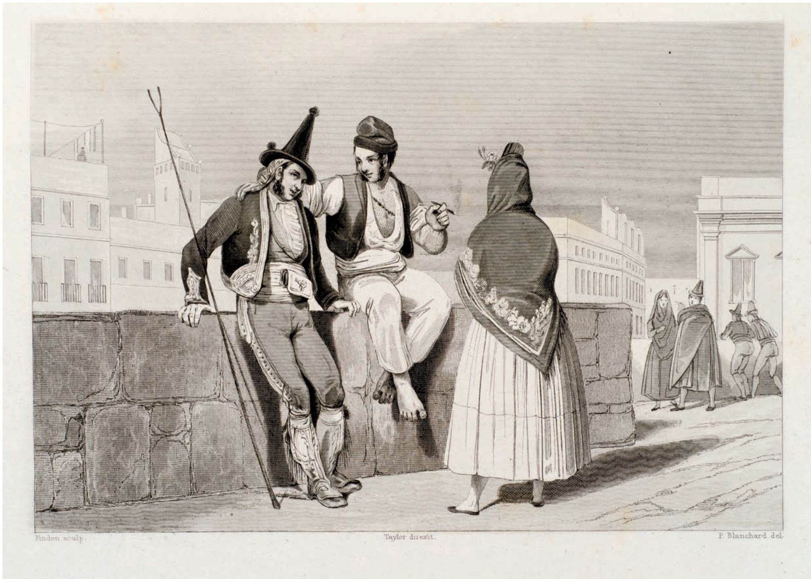
2.5. Pharamond Blanchard, Contrabandier, matelot et femme du peuple , in Voyage pittoresque en Espagne: Planches, Première Partie , no. 75. Engraving by Finden, 129 x 191 mm. New York, The Hispanic Society of America.