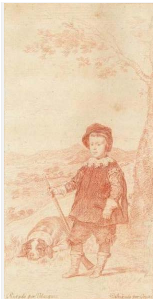
Francisco de Goya y Lucientes, Prince Balthasar Carlos as Hunter (after Velázquez), 1778–79. Red crayon over preliminary drawing in pencil. (Hamburger Kunsthalle, Kupferstichkabinett 38540)

This exhibition has been organized by the Meadows Museum, SMU; the Museo Nacional del Prado; the Hamburger