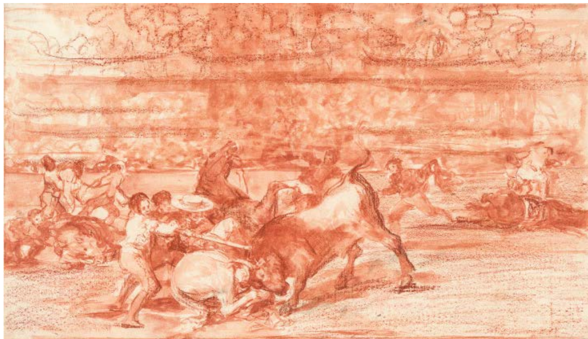
Francisco de Goya y Lucientes, Two Groups of Picadors Overrun Consecutively by a Single Bull, 1814–16. Red chalk and red-ink wash on laid paper (Hamburger Kunsthalle, Kupferstichkabinett 38541;)

Posted in books , catalogues , exhibitions by Editor on August 26, 2014