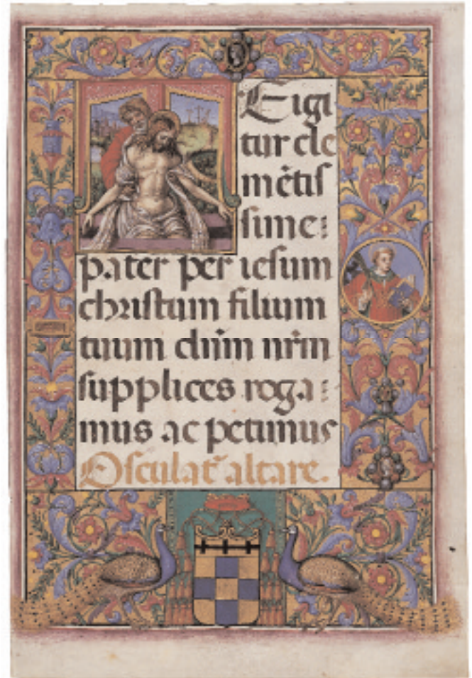
113. Border with the arms of Cardinal Antoniotto Pallavicini and initial "T" ( Te igitur ) with the Pietà , from a Missal with Christmas Mass of Cardinal Antoniotto Pallavicini, by the Pallavicini Master. 1503–07. Colours and gold on vellum, 40 by 27.5 cm. (Biblioteca Nacional de España, Madrid, fol.66r of MS Vitr.22–7; exh. Meadows Museum of the Southern Methodist University, Dallas).

Lamentaciones de Jeremias from a sixteenth-century Sistine Chapel manuscript of the piece.