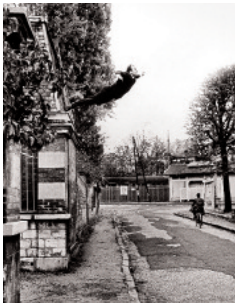
111. Obsession with levitation (Leap into the void) , by Yves Klein. 1960. Black-and-white photograph, 30 by 24 cm. (Yves Klein Archives, Paris; exh. Walker Art Center, Minneapolis).

models as 'human brushes' – may be more notable for the idea they embody or the event and process they record than for the image they present. Yet one of the most impressive works in the exhibition, Mondo Cane shroud – the product of a rehearsal for the filming of the creation of another work that does not survive – has both ethereal delicacy and formal dignity. The handprints it incorporates may now suggest Jasper Johns, but for Klein they echoed prehistoric cave markings and the images of human shadows imprinted by the atomic bomb blast in Hiroshima. 'A painting', wrote Klein, 'is merely a witness, the sensory surface that records what occurs [. . .] the flame of poetry during the pictorial moment. My paintings are the "ashes" of my art'. 7 In his own way Klein is one of the great artists of the atomic age and the space age and of the aftermath of the Second World War: his trademarked International Klein Blue was in part an antidote for the blackness he associated with the War's devastation. The exhibition closed with a room of the so-called fire paintings (Fig. 110), some lyrical, some savage, but all made using a blowtorch as an instrument of creative destruction.